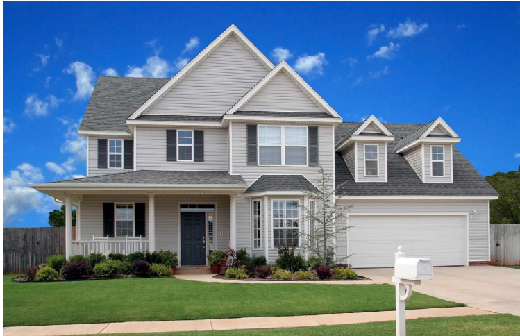
Fisher Nicholson Realty